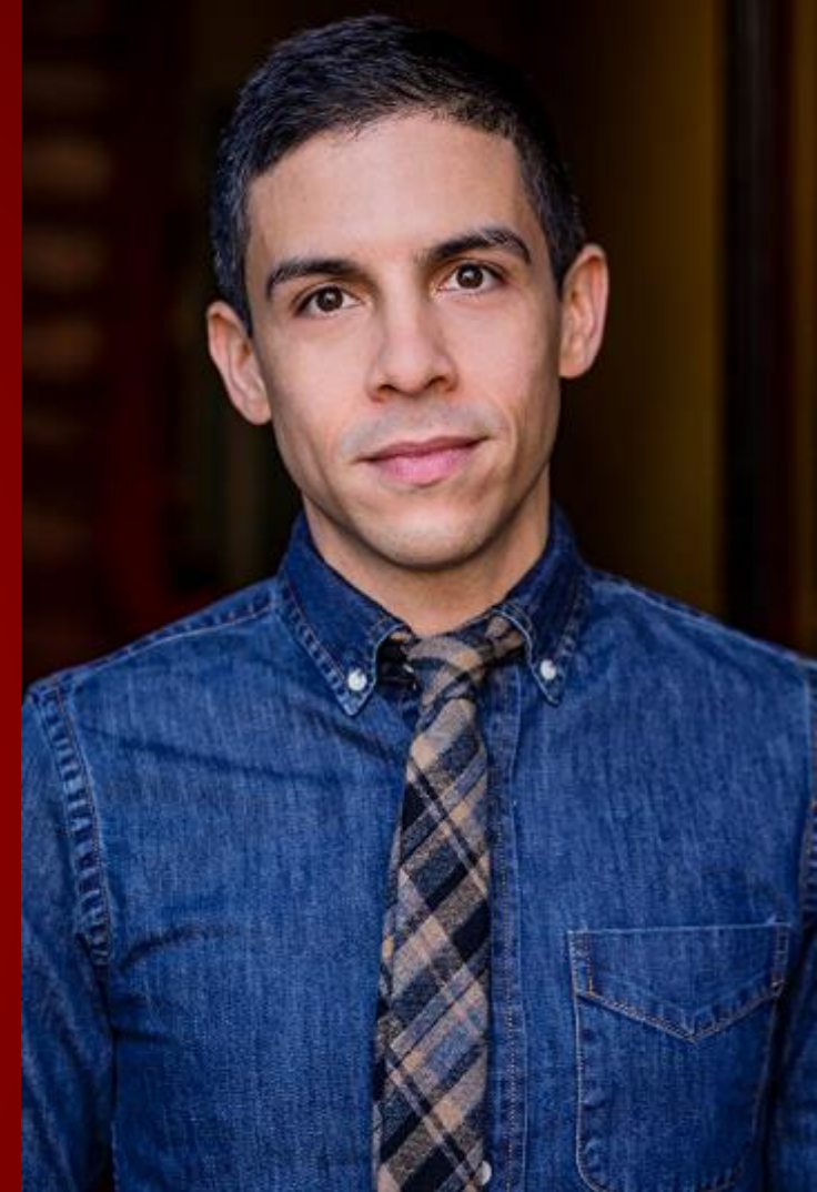
Matthew Lopez (Playwright)

Lopez currently holds new play commissions from Roundabout Theatre Company, Manhattan Theatre Club, Hartford Stage, and South Coast Rep. Lopez was a staff writer on HBO's "The Newsroom" and is currently adapting Javier Marias' trilogy "Your Face Tomorrow" for the screen.